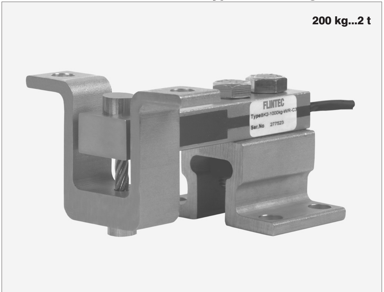
Weigh Module 52-14 with BK2 Load Cell

Flintec load cell supports are designed to prevent unwanted forces from affecting load cell performance.